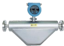
Mass Flow Meter MS-25

As a hi-tech enterprise, Sealand also cooperates with colleges and research institutes to keep technology updated. In the meantime, it concentrates on quality management and obtained Certificate of Quality System ISO9001, ISO14000, ISO45001, Certificate of Metrology, ATEX(TUV), IECEx & CE.