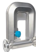
Mass Flow Meter CG-50

Not affected by the fluid, saving design installation cost.