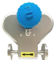
Mass Flow Meter CG-03

Besides common fluid, mass flow meter can measure fluids such as corrosion-resistant capabilities, non-Newtonian fluid, all kinds of slurry, suspensions, etc